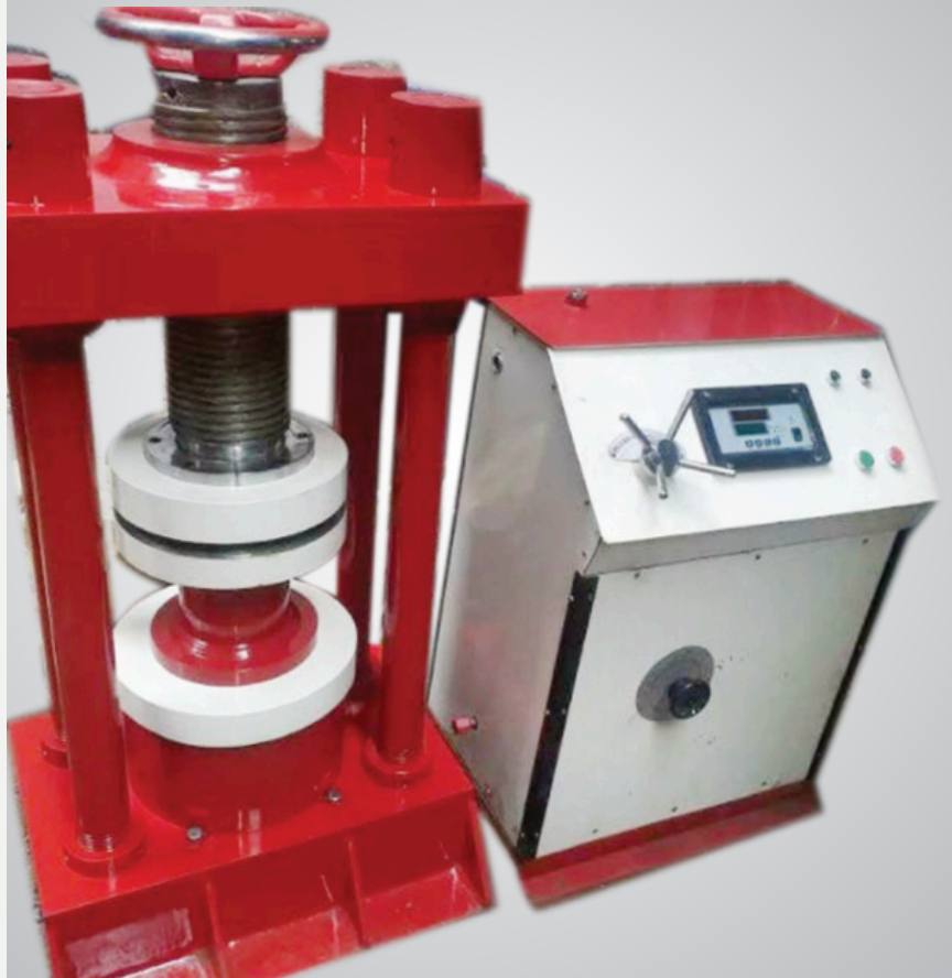
CTM - 2000 Kn (Digital Version)